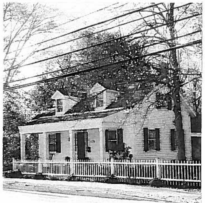
264 Andover Street