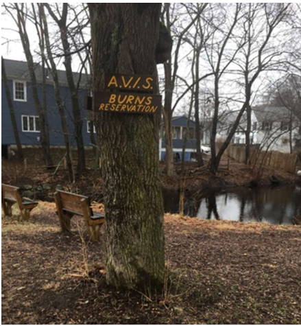
View of Clark Pond in the Burns Reservation from Andover Street.

Pass through the busy intersection where Clark Road meets Andover Street and you'll notice a contrasting pocket of serenity at the picturesque pond across from the fire station. You may even have enjoyed a few quiet moments on the bench there.