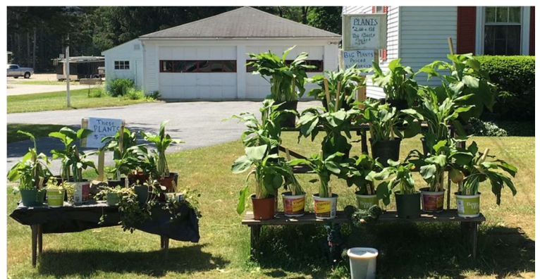
The plant stand at 231 Andover Street was well stocked in 2018.